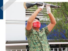
Sec 4 Cadet